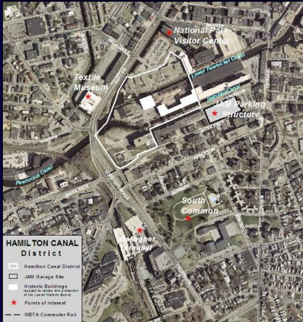
City Of Lowell, MA