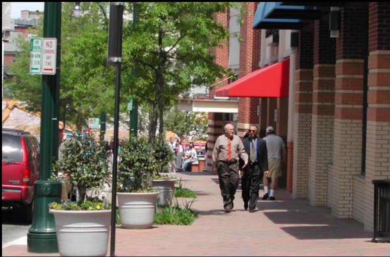
Optional Method Streetscape