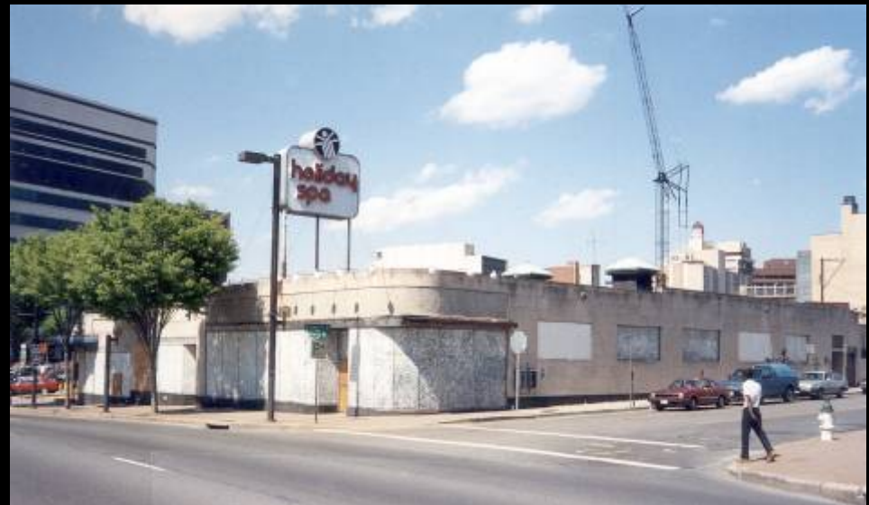
Silver Shopping Center