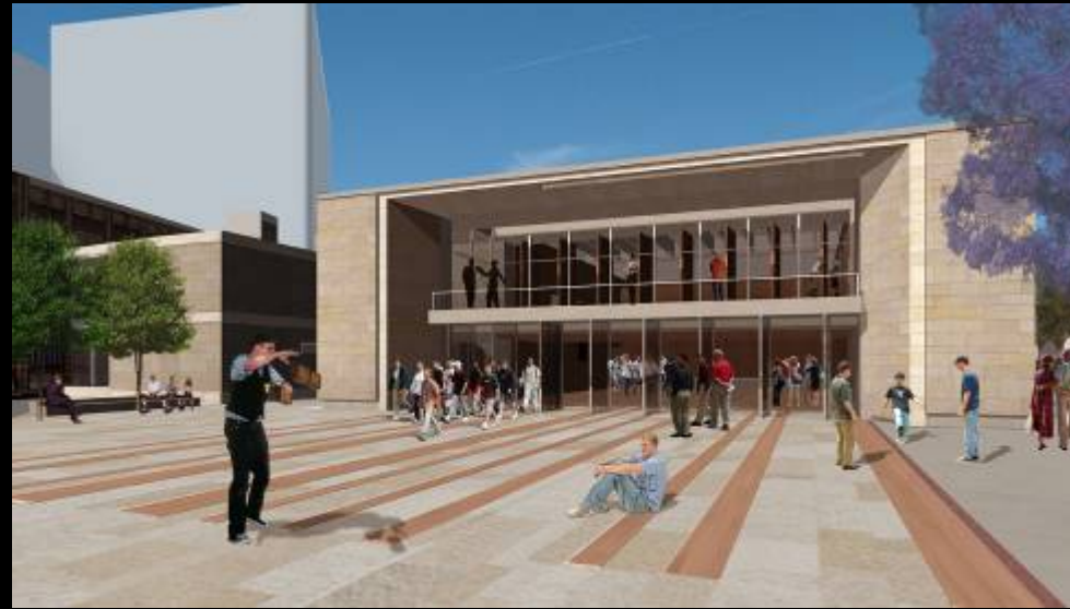
Veterans Plaza & Civic Building