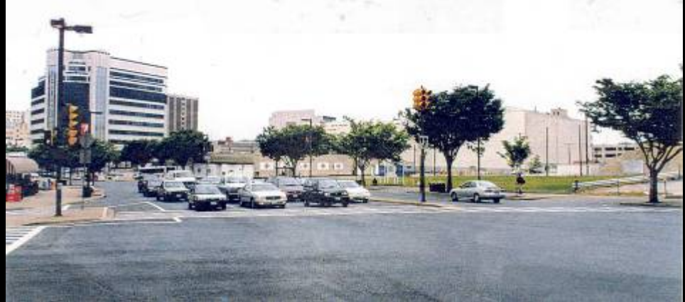
Georgia Avenue (1999)