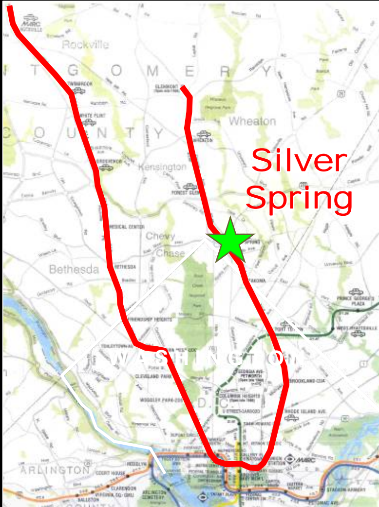
Metrorail (Red Line)