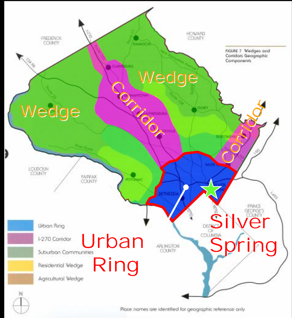
Montgomery County General Plan Wedges and Corridors