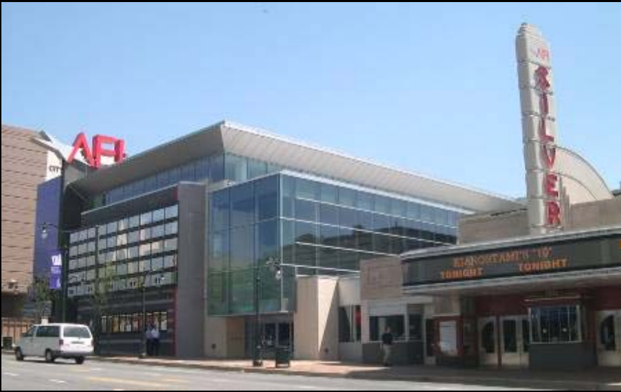
Roundhouse Theater / AFI / Silver Theatre