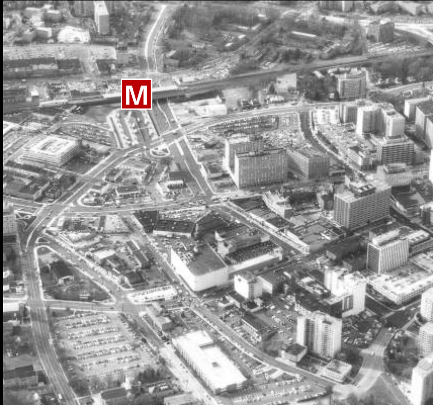
Silver Spring CBD Core (1978)