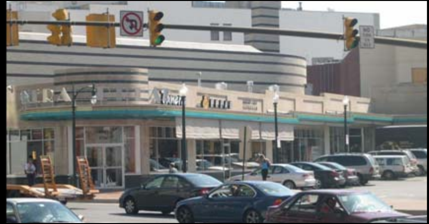
Silver Shopping Center Renovation