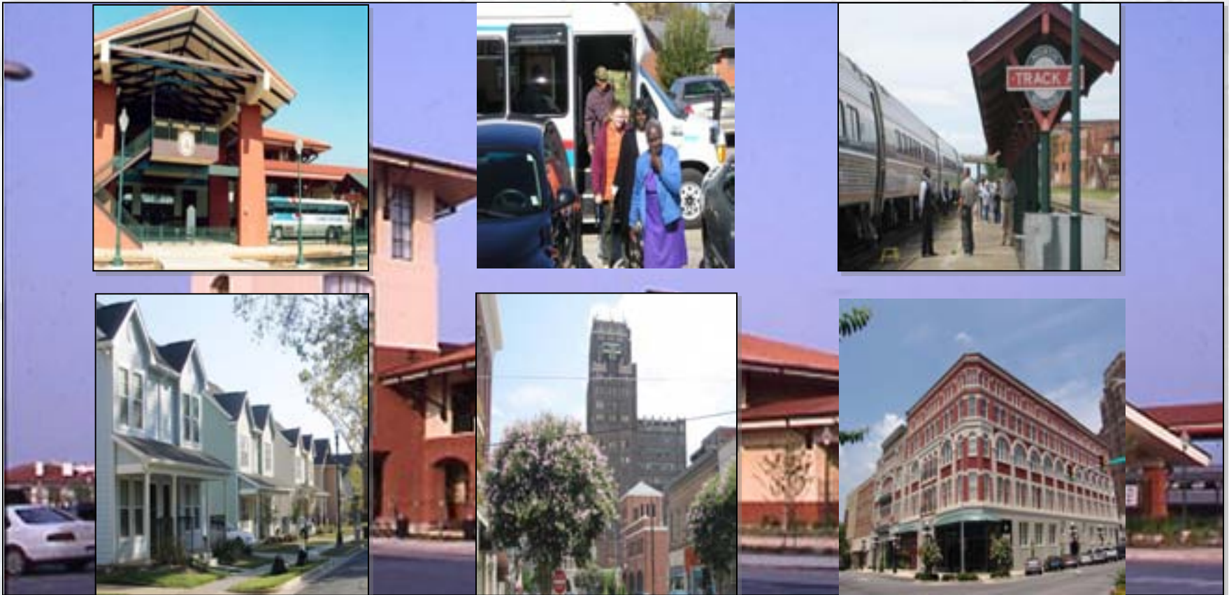
Union Station, Meridian, Mississippi