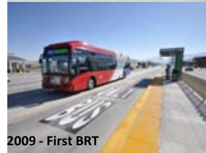
2009 - First BRT