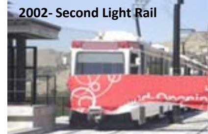
2002 - Second Light Rail