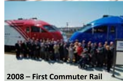
2008 - First Commuter Rail