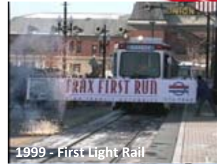
1999 - First Light Rail