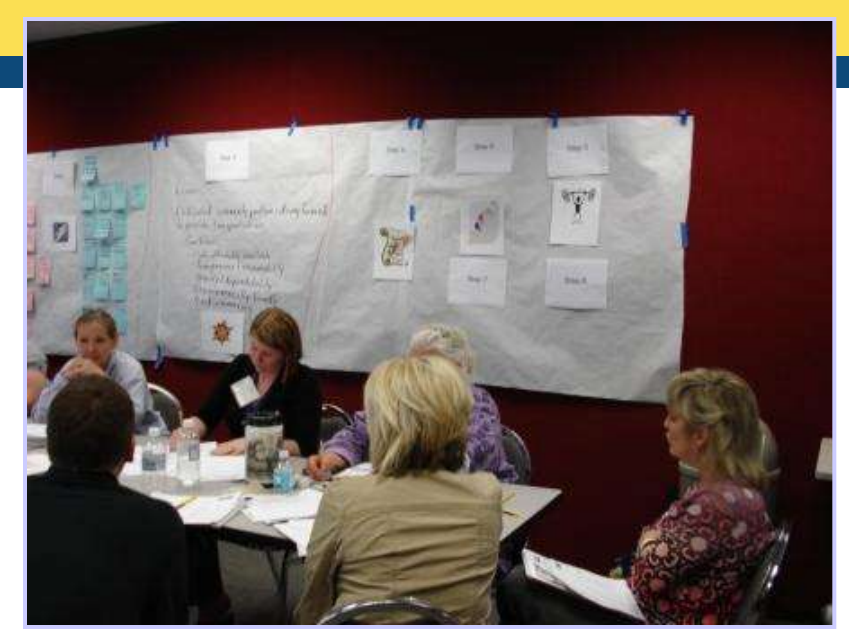
ESPA Coalition Event 2010 Allen County, Ohio