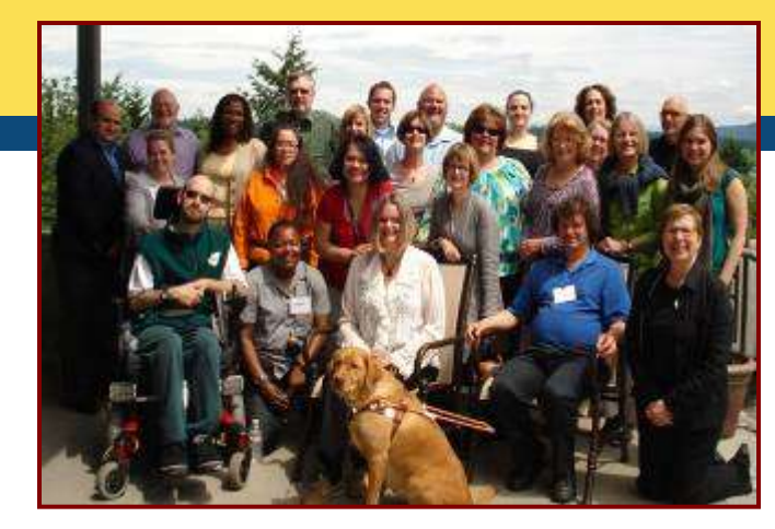
King County ATCI