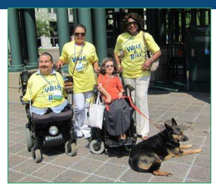
2011 Walk & Roll Memphis, Tenn.