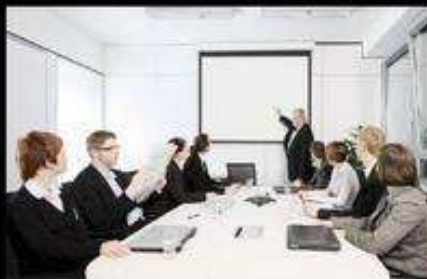
What the APA thinks I do