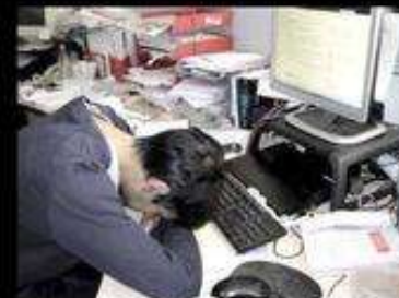
What applicants think I do