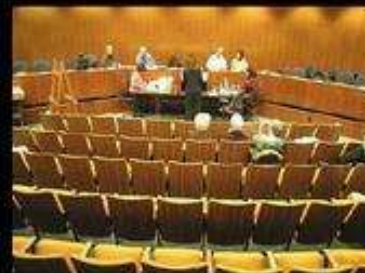
What I really do