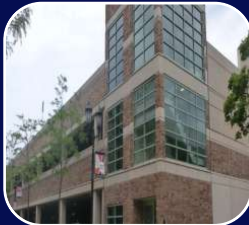
Innovative Financing Plans