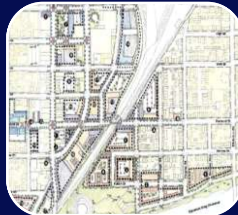
TOD Plan Updates