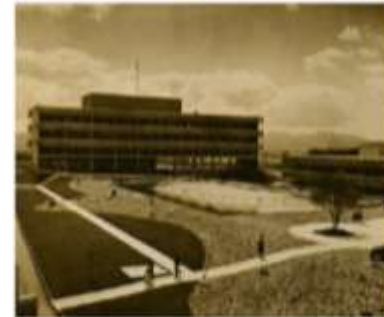
Atomics International 1962