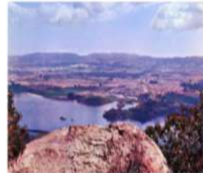
1962 - A full Chatsworth Reservoir with the Hughes missile facility on the shoreline