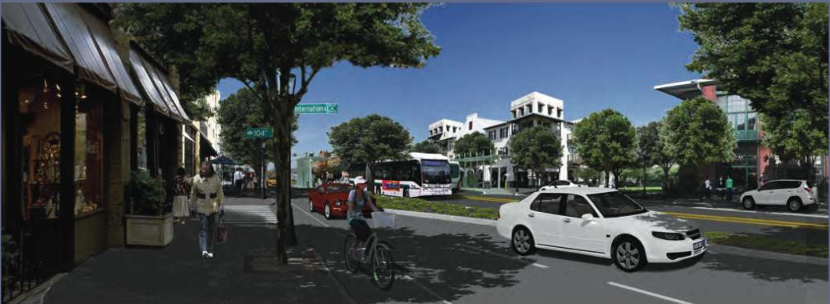
104 th Ave. and International Vision