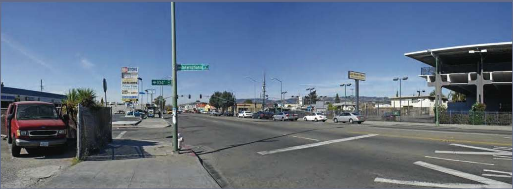
104 th Ave. & Int'l Blvd. Existing Condition