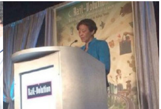
Cutting Edge Speakers