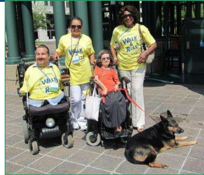
2011 Walk & Roll Memphis, Tenn.