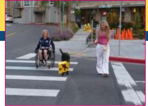
Pedbikeimages.org / Jan Moser 2009