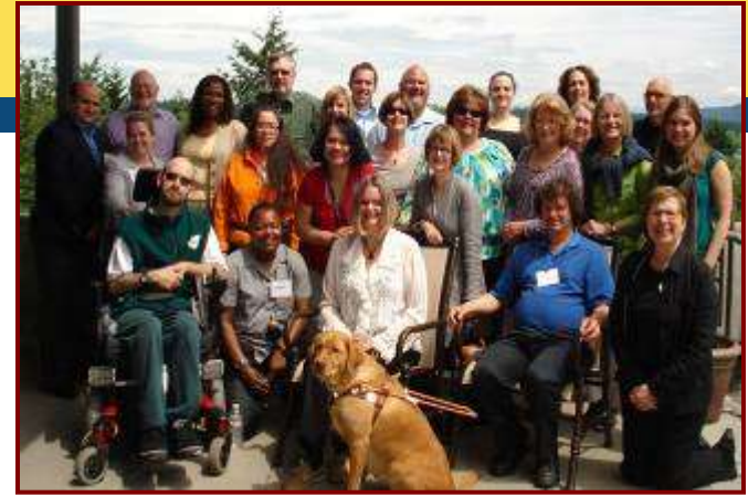
King County ATCI