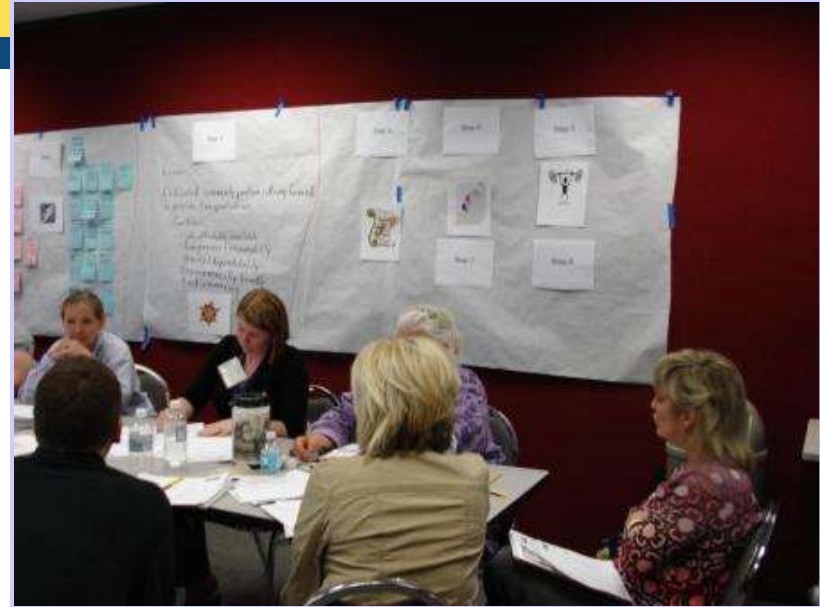
ESPA Coalition Event 2010 Allen County, Ohio